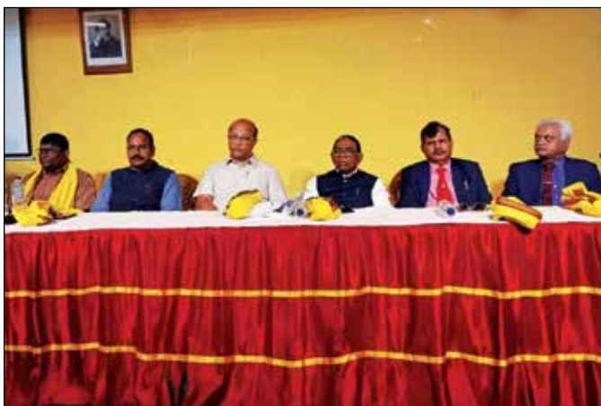
National Symposium conducted by Kolkata Centre on “Electronics, Communication and Computing (ECC-24) on 15 July 2024.