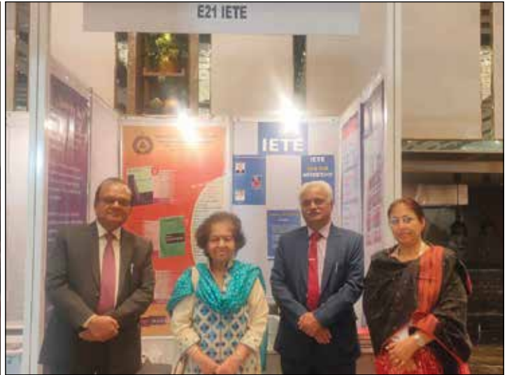
IETE participated in MAPCON-2023, the IEEE Microwaves, Antennas and Propagation Conference held at Ahmedabad from 10-14 Dec 2023.