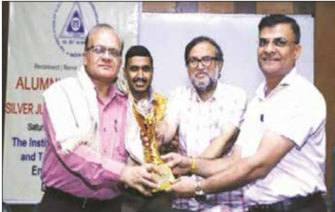
President as Chief Guest at Silver Jubilee and Alumani Meet on 14 Oct 2023 at Delhi Centre