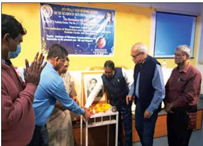
29 th Sir J C Bose Memorial Lecture held at Kolkata Centre on 30 Nov 2023