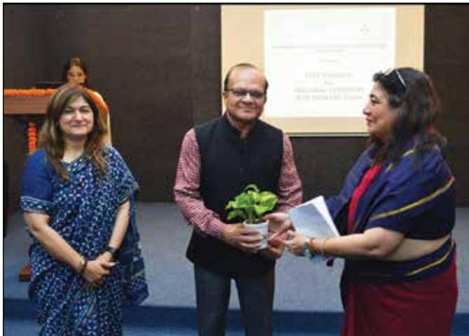
Inauguration of IETE Student's Forum (ISF) at Manav Rachna University on 21 Nov 2023