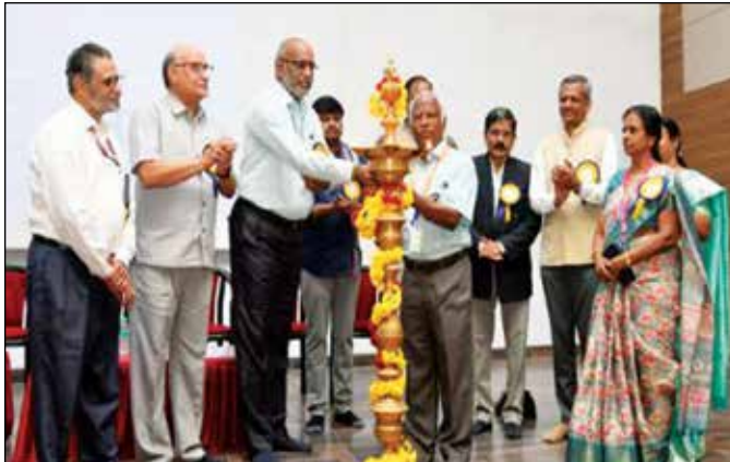
Zonal Seminar alongwith ISF Congress organised by Chennai Centre on 26-27 July 2024 on “Digital Innovation for Sustainable Development” in association with Sai Ram Engineering College.