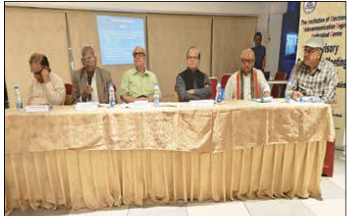
Advisory Committee Meeting of Hyderabad Centre on 04 Nov 2023