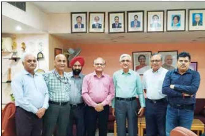
Chief Editors of IETE Journal of Research at IETE HQ on 27 April 2024