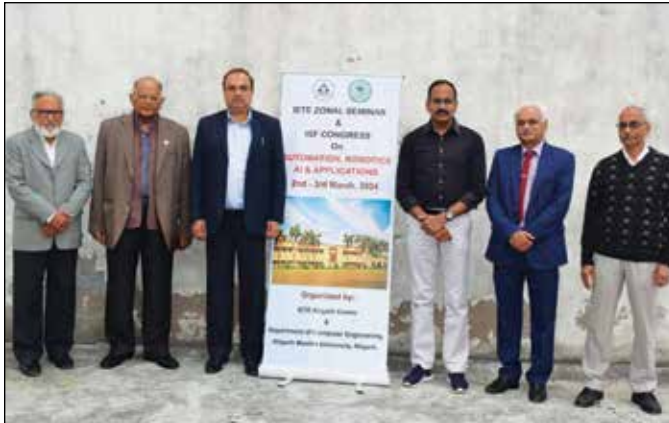
Zonal Seminar alongwith ISF Congress organised by Aligarh Centre on 02-03 March 2024 on “Automation, Robotics, AI & Applications” in association with Zakir Hussain College of Engg and Technology, Aligarh Muslim University