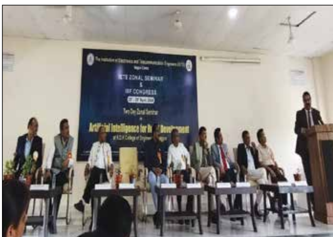
Zonal Seminar alongwith ISF Congress organised by Nagpur Centre on 28-29 April 2024 on “Artificial Intelligence for Rural Development”.