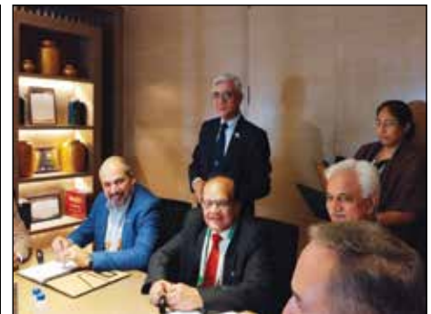
Memorandum of Understanding (MoU) with IEEE-AP-S (Antennas and Propagation Society), IEEE-EMC-S (Electro Magnetic Compatibility Society) and IEEE-MTT-S (Microwave Theory and Techniques Society) on 12 Dec 2023 at MAPCON 2023, Ahmedabad