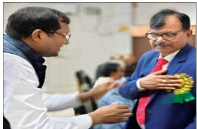
Zonal Seminar alongwith ISF Congress organised by Allahabad Centre on 17-18 Feb 2024 on “Modern Communication Utilising AI” in association with J K Institute of Applied Physics and Tehnology, University of Allahabad.