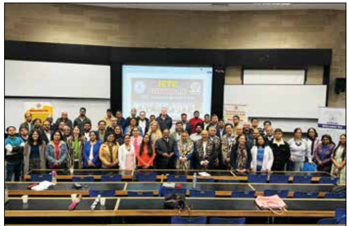
IETE Australian Professional Activity Centre conducted 22 nd International Symposium and Annual Day on 28 July 2024