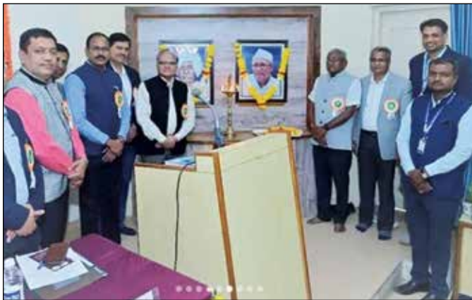
The National Technical Paper Contest (NTPC) - 2024 conducted by IETE and Pravara Activity Centre on 01-02 April 2024 at Pravara Rural Engineering College, Loni Ahmednagar.