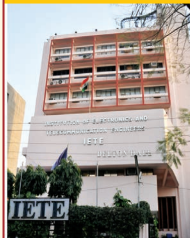
IETE HQs, New Delhi