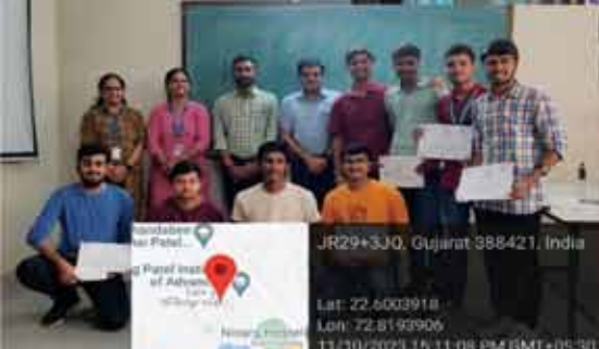
JR29+3JO, Gujarat 388421, India Lat: 22.5003918° Lon: 72.8193906° 11/10/2023 15:11:08 PM GMT +05:30