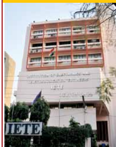
IETE HQs, New Delhi