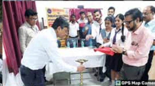
Durgapur, West Bengal, India Main Building, Fulhore Road, Kalgani, Durgapur, West Bengal 713206, India Lat: 23.544132° Long: 87.342678° 27/09/23 03:00 PM GMT +05:30