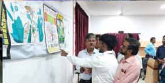
Durgapur, West Bengal, India Main Building, Fulhore Road, Kalgani, Durgapur, West Bengal 713206, India Lat: 23.543918° Long: 87.342345° 26/09/23 03:54 PM GMT +05:30