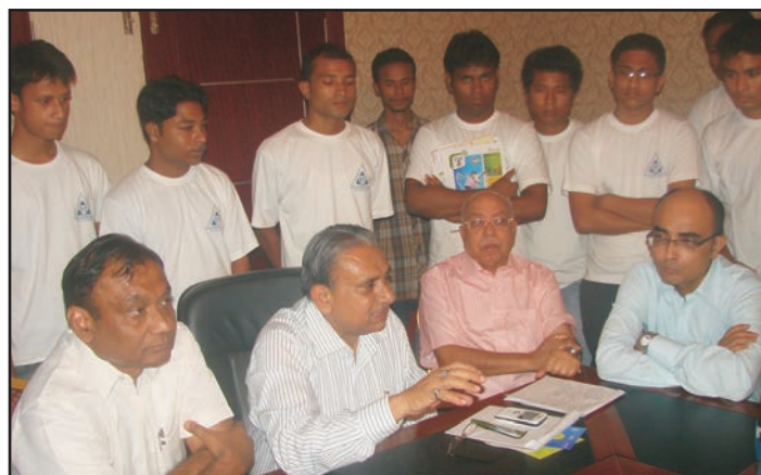
President IETE, interacting with students