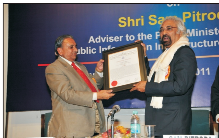
Shri Sam Pitroda

Adviser to the Prime Minister of India on Public Information Infrastructure and Innovations