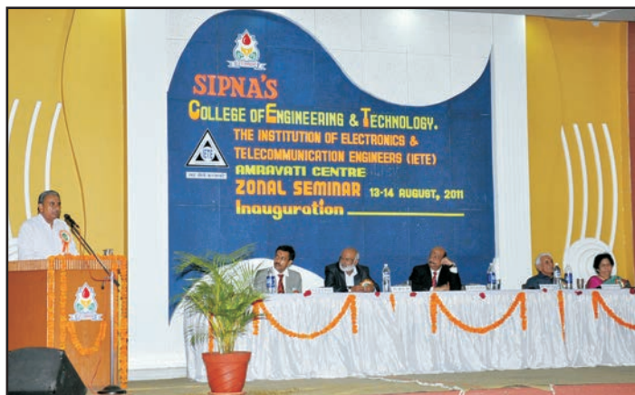
President IETE addressing the seminar