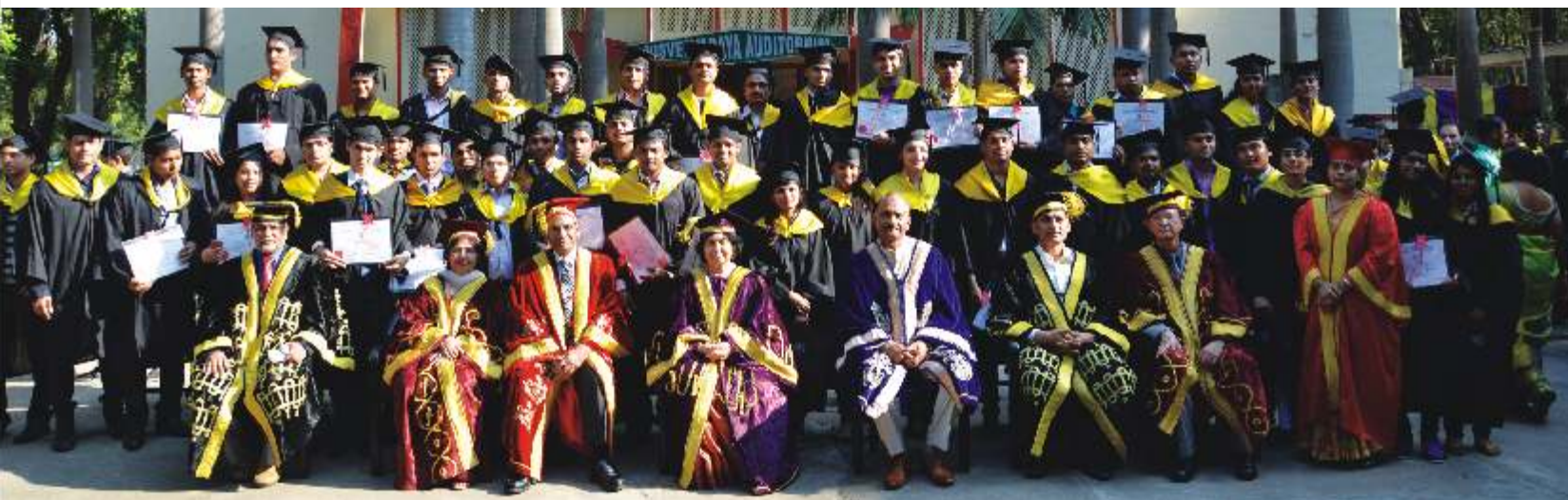
Passing out IETE Graduates at Vadodara