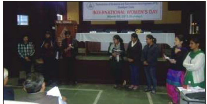
International Women's Day celebrated at IETE Chandigarh Centre