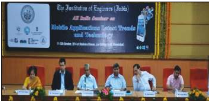
Seminar in progress