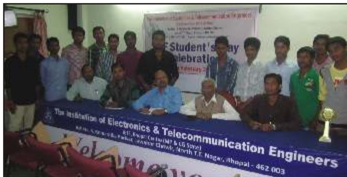
IETE Student's Day at Bhopal Centre