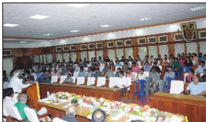
IETE Foundation Day celebration in progress, Tirupati