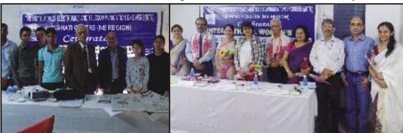
IETE Students' Day & International Women's Day at Guwahati Centre