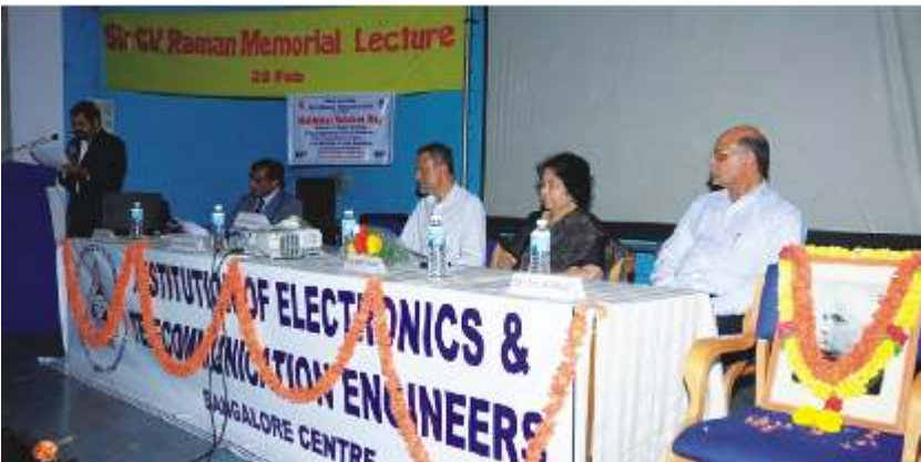
19th Sir C V Raman Memorial Lecture celebrations in progress