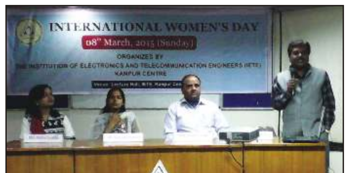
IETE Kanpur Centre celebrating International Women's Day