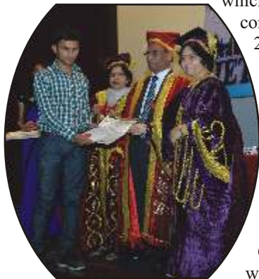
The Chief Guest doing the honours

The 8 th Annual Convocation of the Institution of Electronics and Telecommunication Engineers (IETE) was held on 3 rd Jan 2015 at Viswesvaria Auditorium, EME School, Fatehgunj, Vadodara, in which graduate/post graduate degrees were conferred to the successful students of the 2013-14 batch. This total pass out students were 595 (ALCCS-23 & AMIETE-572) but the convocation was attended by 184 students.