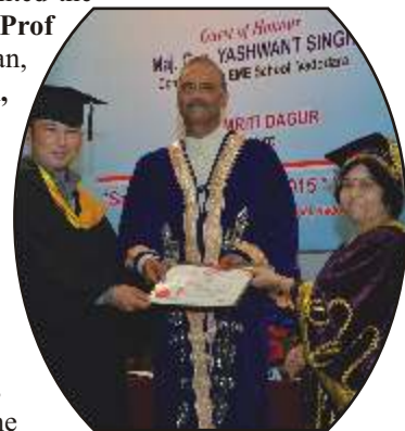
The Guest of Honour