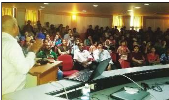
IETE Students' at Shimoga