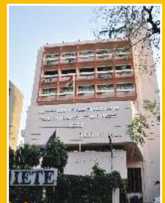
IETE HQs, New Delhi