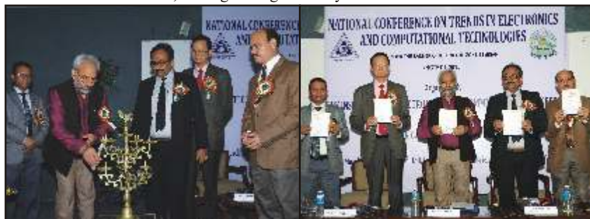
Inaugural Session of the National Conference