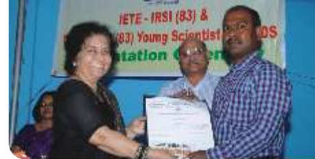
IETE – IRSI (83) Young Scientist Awardees