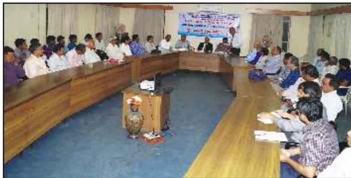
15 th Shri U V Warlu Memorial Lecture in progress