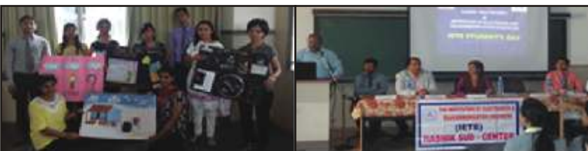
IETE Students' Day at Nashik Sub-Centre

reading the message from President IETE. The Chief Guest highlighted the scope & opportunities for electronics engineers in coming future. A technical poster competition was also organized to commemorate the event.