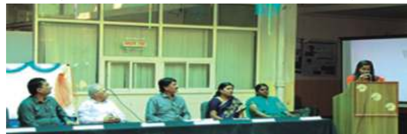
International Women's Day at Aurangabad