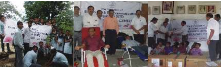
Social responsibility activities of the Centre towards the society