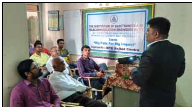
Members Celebrating WTISD 2017 at IETE Rajkot Centre