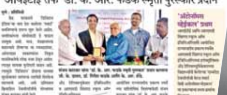
डॉ. के. आर. फडके स्मृती पुरस्कार प्रदान... डॉ. के. आर. फडके स्मृती पुरस्कार प्रदान...