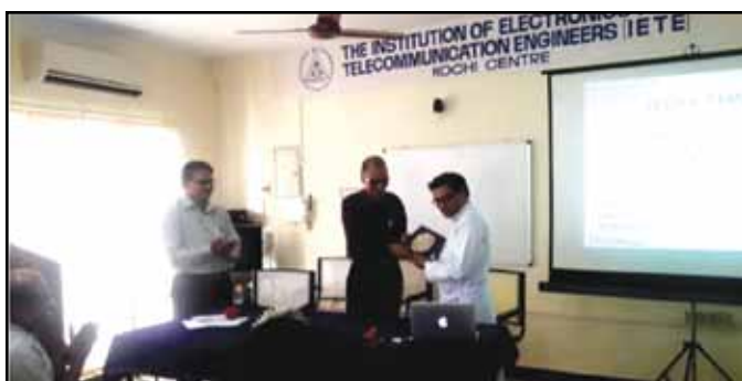
Memento presentation after WTISD programme at IETE Kochi Centre.