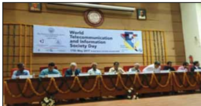
49 th World Telecommunication and Information Society Day being observed at IETE Ahmedabad on 17 May 2017.