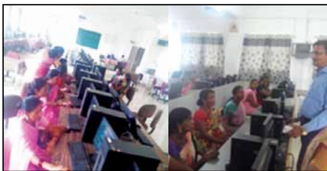
Participants of workshop-cum hands-on training on “ Computer and Internet ” at IETE Amravati Centre.

The Centre arranged for a one-day workshop-cum hands-on training on “ Computer and Internet ” on 12 th Jul 2017 at the Dept of IT of ISF- Vidarbha Youth Welfare Society’s Prof Ram Meghe Institute of Technology & Research Badnera, Amravati