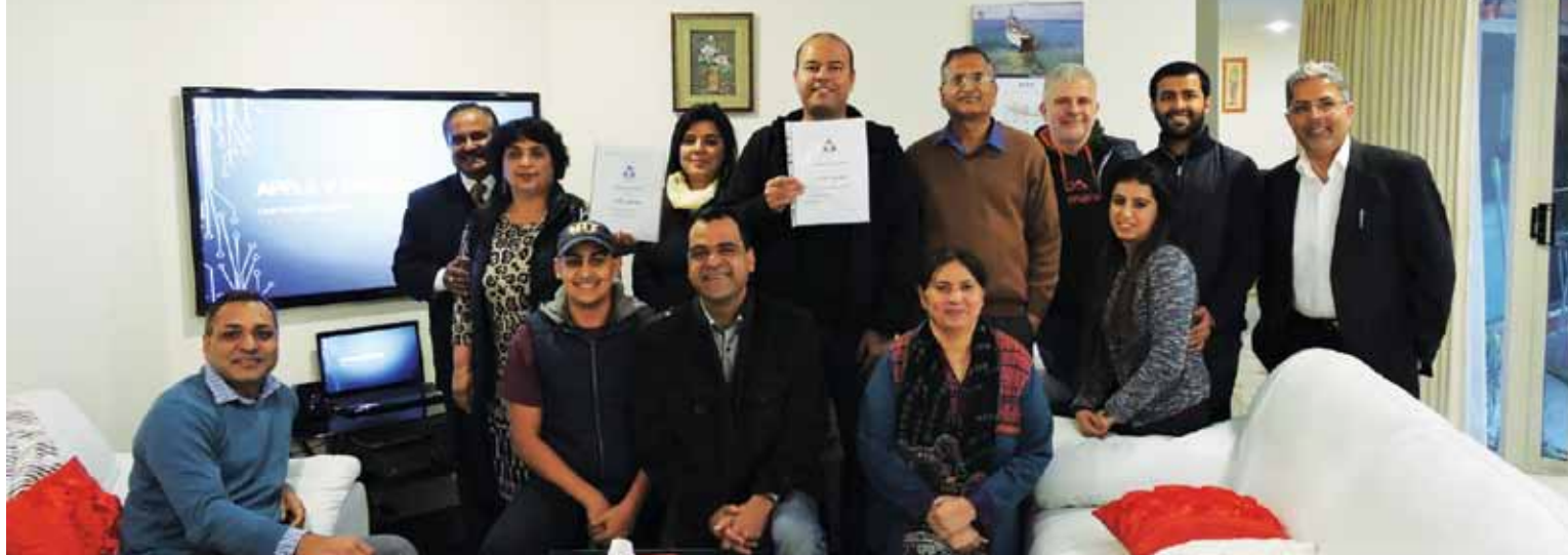
Participants of the 3 rd meeting of IETE PAC Australia, held at Perth on 30 th July 2017

We are indeed grateful to our fellow brethren / corporate members, who with their dint of unbounded enthusiasm and passion are proactive in furthering the aims and objectives of India's premier professional Institution- IETE.