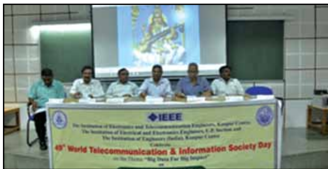
Sister Societies celebrating WTISD - 2017 jointly at IIT Kanpur