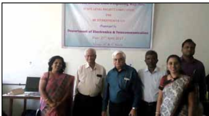
IETE Pune Centre Chairman with organisers of project competition.