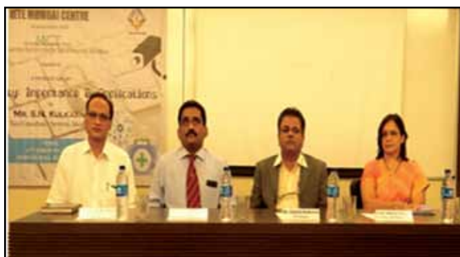
Dignitaries on dais during technical talk on “Cyber Security: Importance and Applications” at IETE Mumbai Centre.