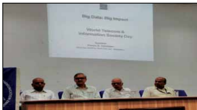
Dignitaries on the dais during WTISD - 2017 at Vadodara Centre.