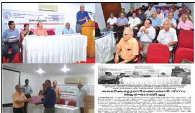
Glimpses of WTISD 2017 celebration at Palakkad Centre