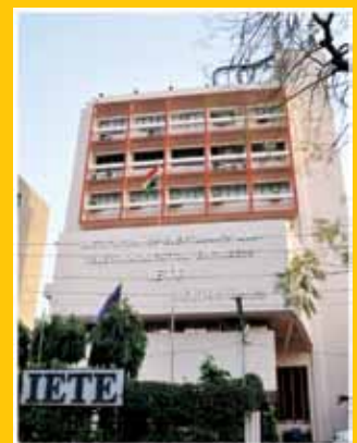
IETE HQs, New Delhi