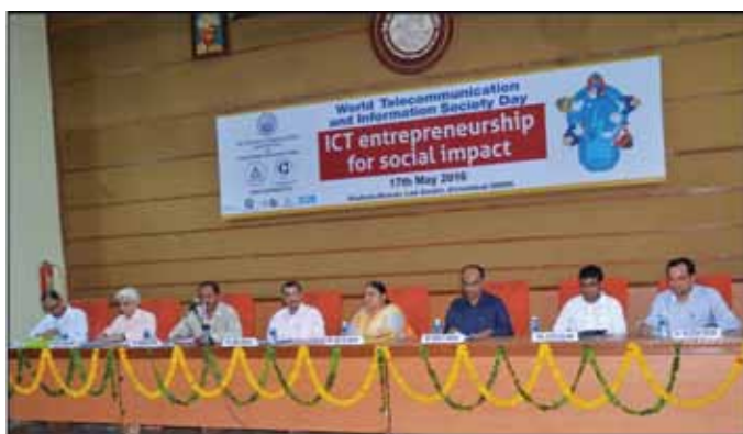
48 th WTISD-2016 celebrated at IETE Ahmedabad Centre