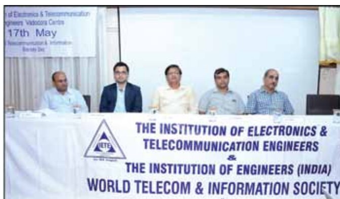
IETE Vadodara Centre commemorating 48 th WTISD 2016