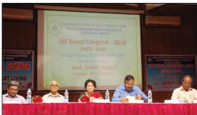
The session in progress