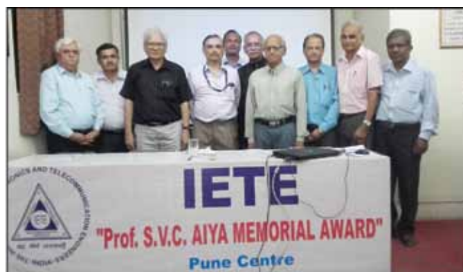
Dignitaries during Prof SVC Aiya Memorial Award function, Pune