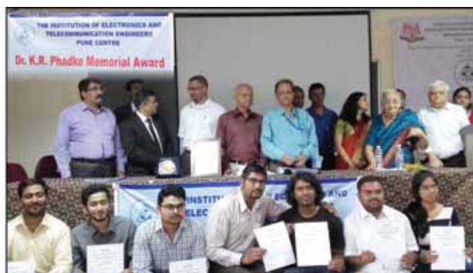
Dignitaries on dais and winners of the project competition off the dais

◆ 48 th World Telecommunication & Information Society Day was celebrated under the auspices of IETE Pune Centre,