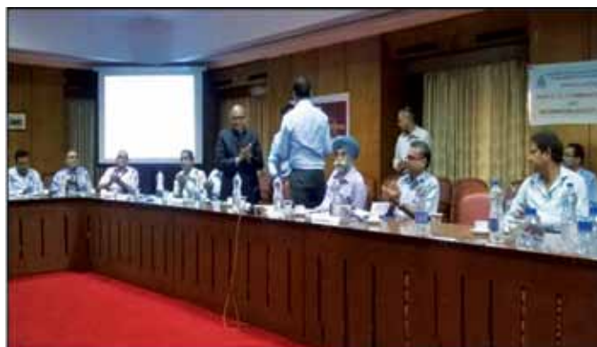
The session in progress