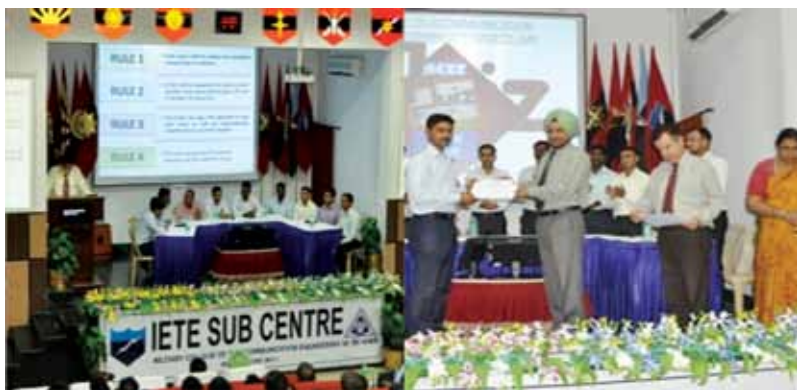
Celebrations of World Telecommunication & Information Society Day at IETE Mhow Sub Centre