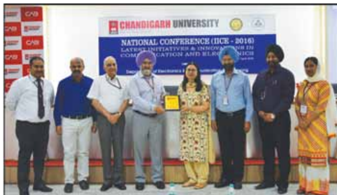
Dignitaries on the dais during the National Conference