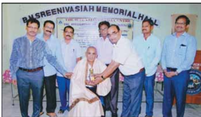
The chief guest being felicitated on the occasion, Vijayawada