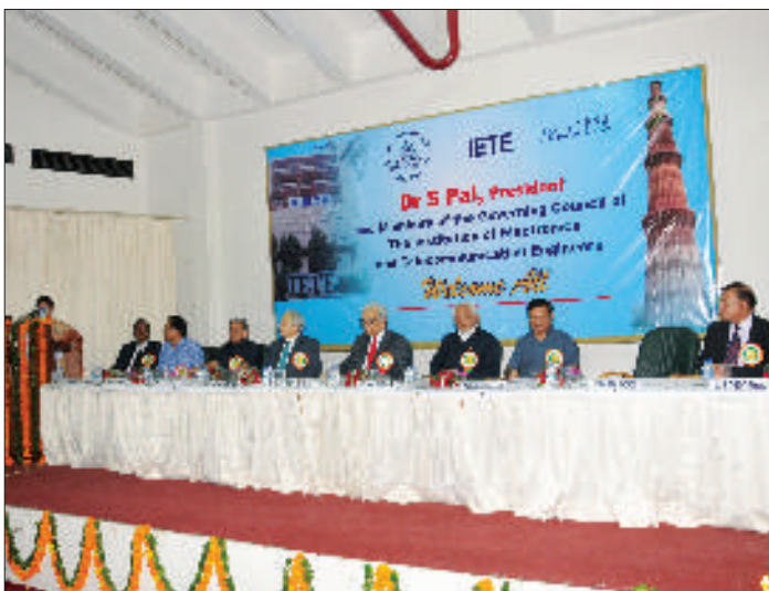
Dignitaries on the dais during 45th WTISD-2013