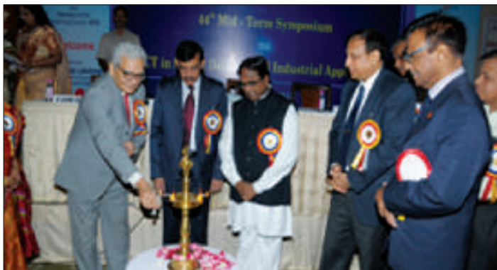
Dignitaries lighting the inaugural lamp

The 44 th IETE Mid-Term Symposium (MTS) on the theme, "ICT in Space, Defence and Industrial Applications" was successfully held during 21-22 April at Hotel Green Park, Begumpet, Hyderabad. Shri Ponnala Lakshmaiah , Hon'ble Minister of IT & Communications, Government of Andhra Pradesh was the Chief Guest and Lt Gen S M Mehta , AVSM, SM, VSM, Commandant & Colonel Commandant MCEME, Secunderabad, AP was the Guest of Honour. The proceedings of the Symposium started with the lighting of the inaugural lamp by the dignitaries amid invocation. With the Chief Guest, the other dignitaries sitting on the dais were: Lt Gen S M Mehta , AVSM, SM, VSM, Commandant & Colonel Commandant MCEME, Secunderabad, AP; Shri Avinash Chander , Distinguished Scientist & Chief Controller R & D (MSS), DRDO; and appointed as Scientific Adviser to the Defence Minister, Dr S Pal , President, IETE; Prof (Ms) K Raja Rajeswari , Chairperson, IETE Technical Programmes Committee; Shri P S Sundaram , Co-Chairman, Technical Programmes Committee, Shri K Subbi Reddy , Chairman IETE Hyderabad Centre and Shri S R Aggarwal , Secretary General, IETE.