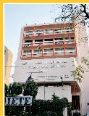
IETE HQs, New Delhi