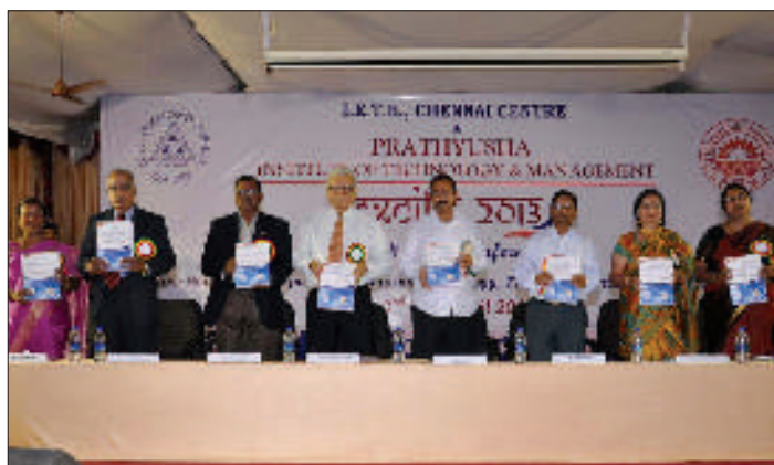
Dignitaries releasing the Conference Proceedings