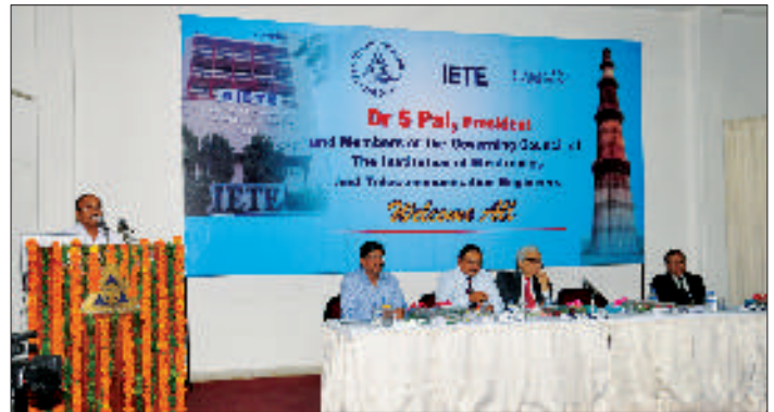
Dignitaries on the dais during the Apex Forum on DRM Technology