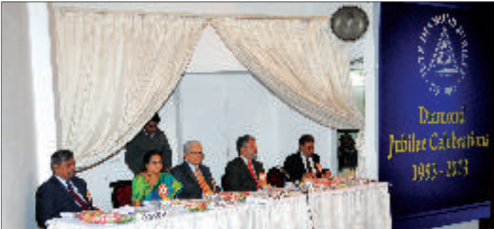
Dignitaries on the dais during the 18 th Sir J C Bose Memorial Lecture