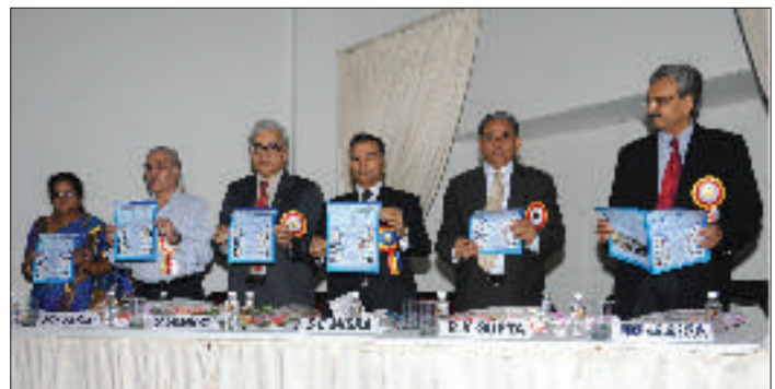
Dignitaries releasing the Diamond Jubilee brochure