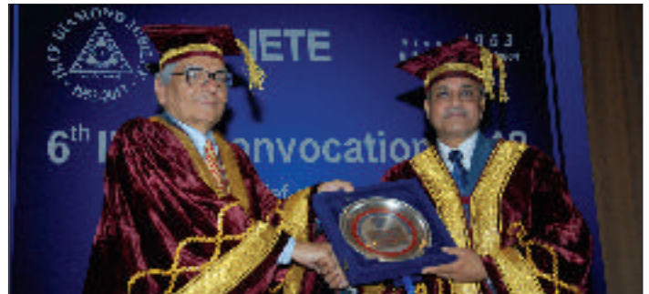
The Chief Guest receiving memento from President IETE