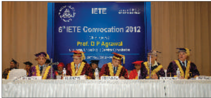
Dignitaries on the dais during the 6 th IETE Convocation 2012