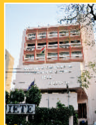
IETE HQs, New Delhi