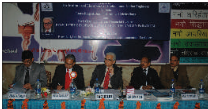
Dignitaries on the dais during the 23 rd Gian Chand Jain Memorial Lecture