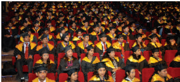
6 th IETE Convocation- 2012 in progress