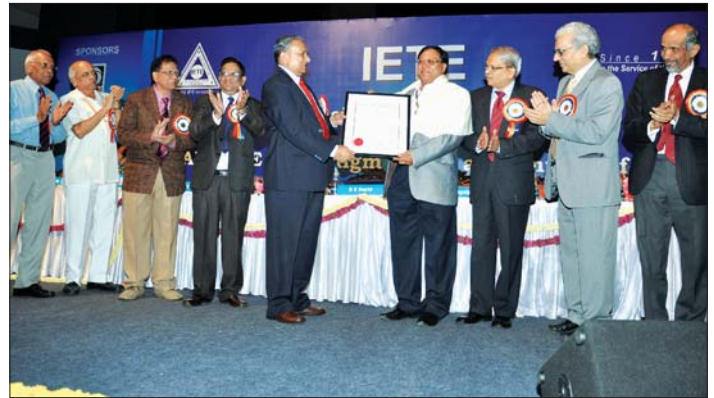
Conferment of IETE Honorary Fellowship on Dr V K Saraswat