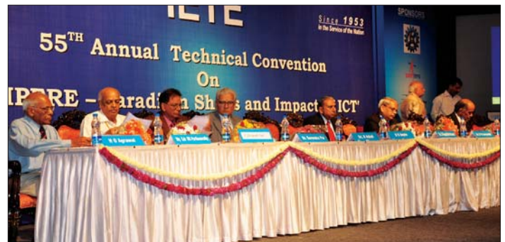
Dignitaries during the inaugural ceremony