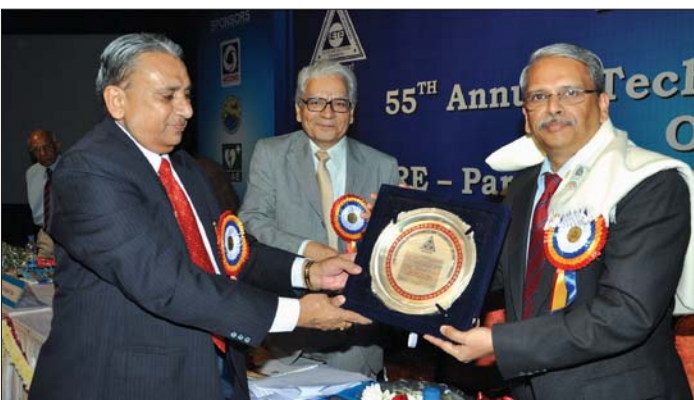
The Chief Guest receiving the memento from the President IETE.