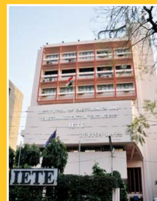
IETE HQs, New Delhi