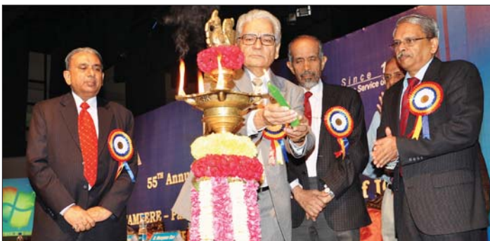
Dignitaries lighting the inaugural lamp